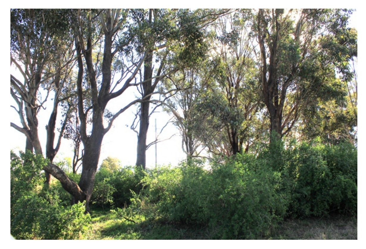
Photo 8 – Remnant Cumberland Plain Woodland adjacent to the western study area boundary