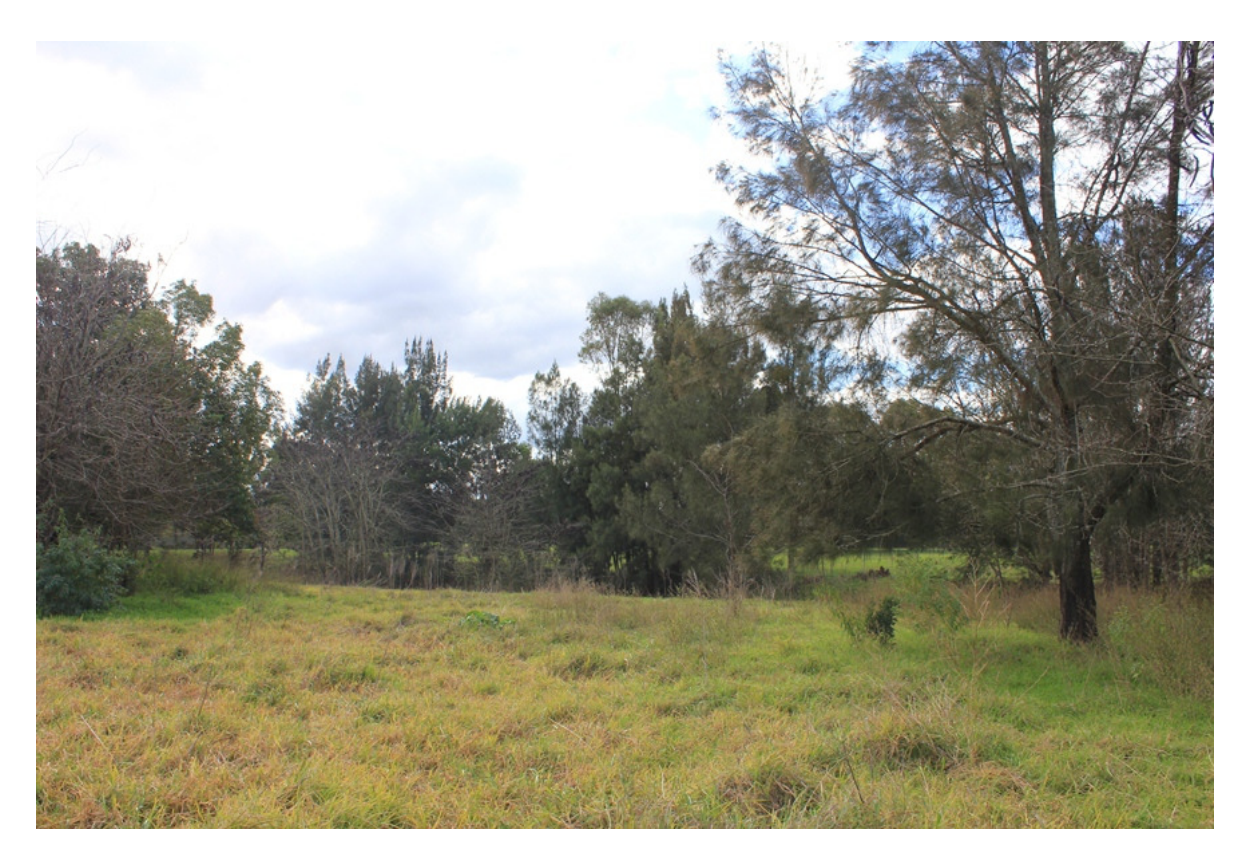
Photo 4 – Riparian Open Woodland along Rickabys Creek at the southern end of Transect 4

The mid-storey was largely absent except for the far southern reaches of the study area. Mid-storey species include Melaleuca linariifolia , Melaleuca styphelioides , Acacia floribunda , Acacia falcata , Acacia parramattensis and Bursaria spinosa .