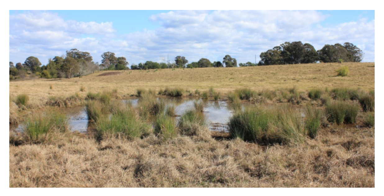
Photo 7 – Freshwater Wetland near the southern study area boundary

This community although small in area (is considered to be a part of the EEC Sydney Freshwater Wetlands.