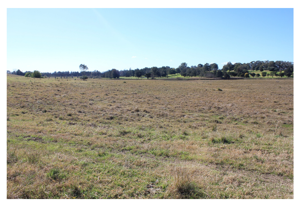
Photo 2 – Eastern section of the study area looking north-easterly from the largest dam

Very few native species were observed within this vegetation community, with native species generally comprising less than 10% of the ground cover.