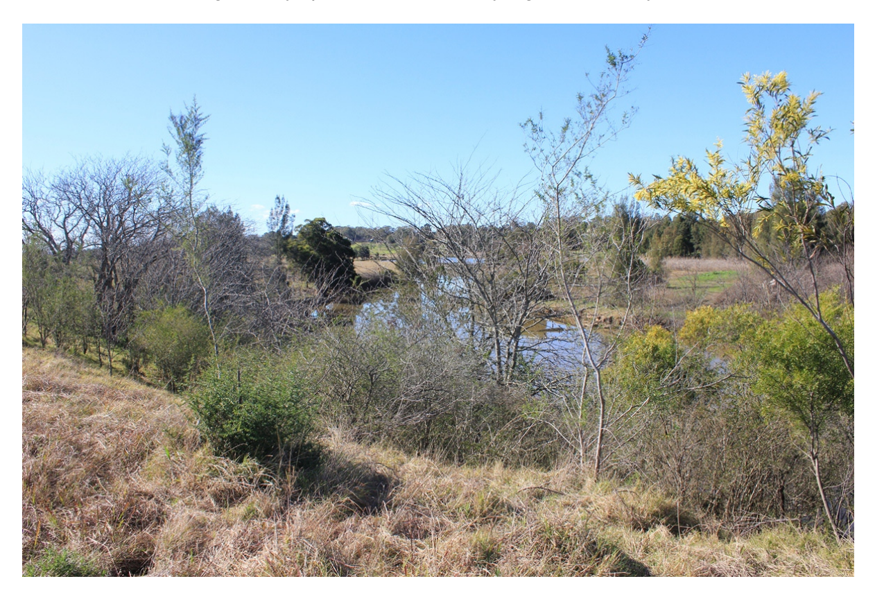
Photo 3 – Riparian Open Woodland near the south-western corner of the study area

Common native canopy species included Casuarina glauca (Swamp Oak) up to a height of 12-15m. These were generally sparse or occasionally higher in density.